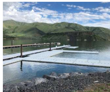
2020 - Empty docks reflect a sign of the times

Even so, we are asking where the summer went, and can hardly believe kids are heading back to school. Throughout the summer, SISO has redirected efforts and resources in the interest of public safety. Instead of sailing camps, we have been improving our infrastructure, so next summer we will be ahead of the curve and ready to launch in style.