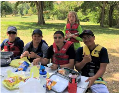
Time for Lunch - Sailing Camp 2019