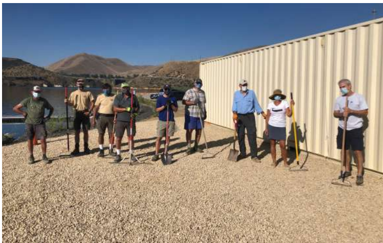
Morning Gravel Workshop: Thanks to our many volunteers and Idaho Dept. of State Parks and Recreation - 13 cubic yards in place in one hour. Thank you Rushmann Sand and Gravel for the gravel.