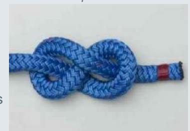
Figure Eight Knot