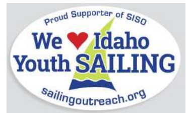
New stickers hot off the press