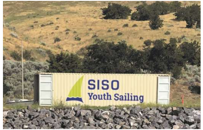
Proposed future lake view of SISO Clubhouse

So again.....please help us help the youth of Idaho. "There is nothing, absolutely nothing, half so much worth doing as simply messing about in boats." Kenneth Grahame The Wind in the Willows