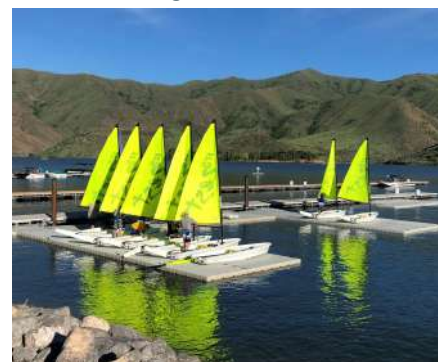
2019 - Docks reflect a summer full of adventure