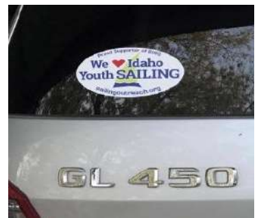
Show us your support