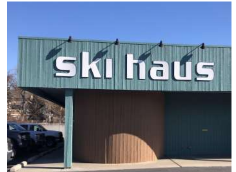
Greenwoods Ski Haus - Bogus Basin Road