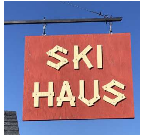
Signage above the original Greenwood's Ski Shop located across the parking lot of current location.