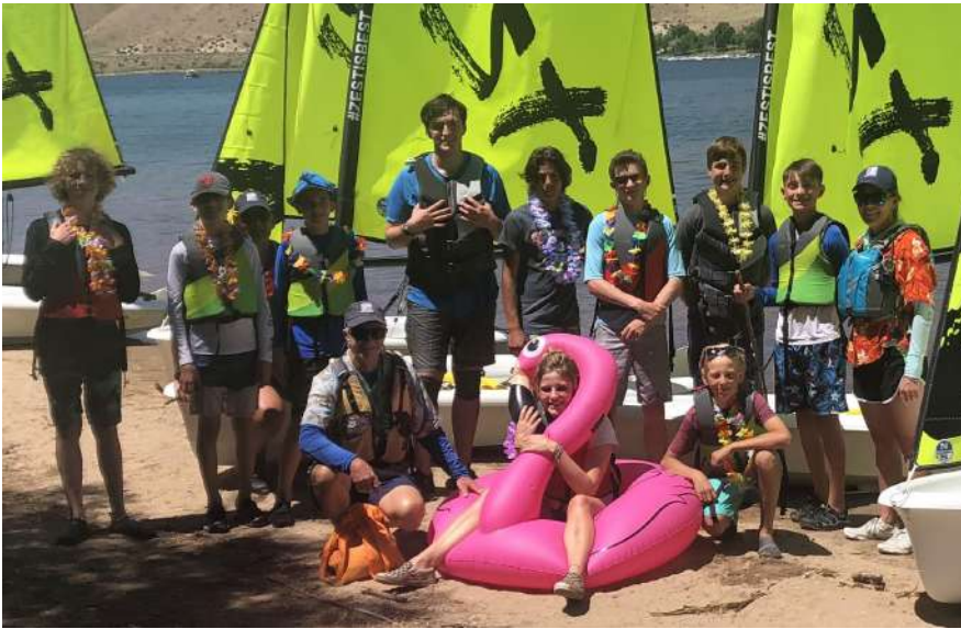
Hawaii SISO Style