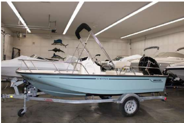
New Safety / Chase Boat DORIS D

We wish to thank all our donors, and especially the anonymous donor who so generously sponsored the matching grant for this fund-raising campaign. Thank you.