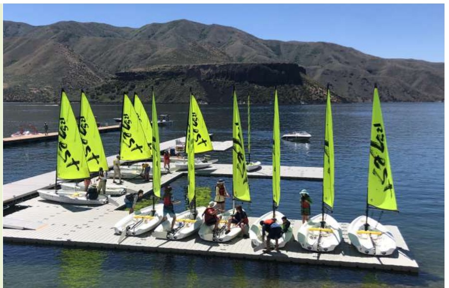
Youth sailors rigging boats for an afternoon sail