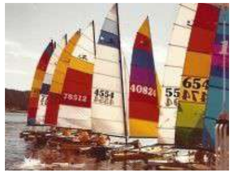
Hobie Beach, Lake Cascade