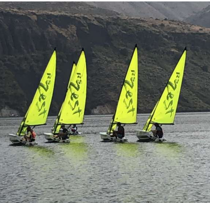
Intermediate Sailors Racing to the Windward Mark