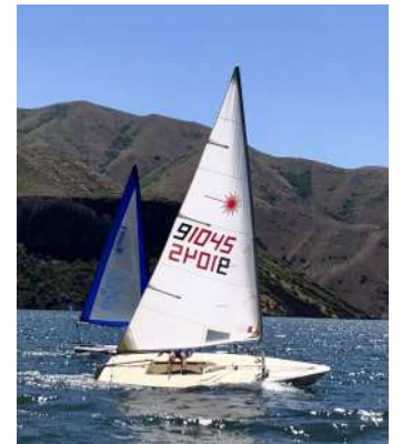
Laser frenzy at race camp.