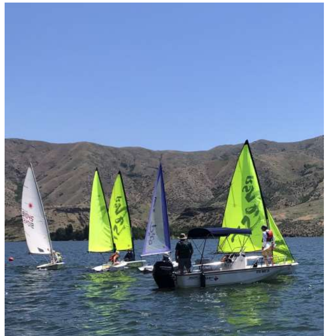
All clear at the starting line. Race On!

Based on the success of this racing camp, it is going to be a fun challenge to keep feeding the appetites of the these young sailors with a craving to race sailboats.