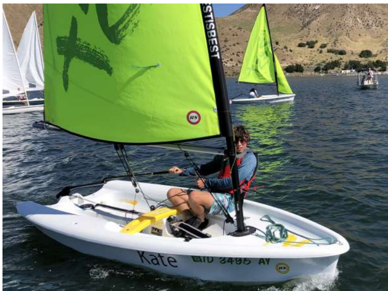
On the line and sailing fast in clear air makes a good start.