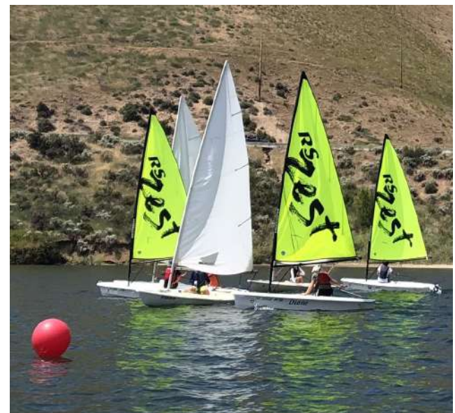
Looking for the layline to the mark.