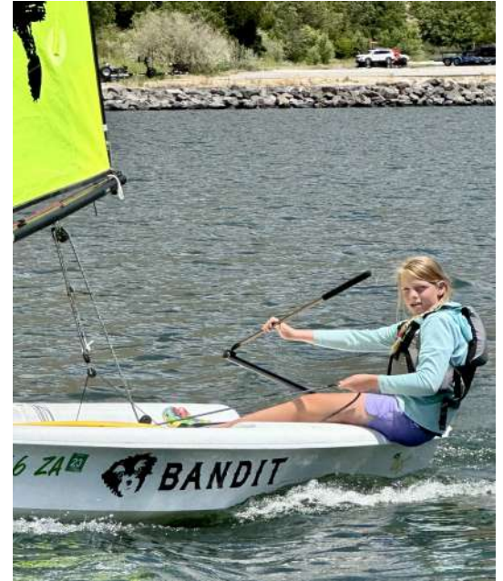
Sailing with confidence

This represents the realization of SISO's goals of introducing the lifelong sport of sailing to Idaho youth and to develop a new generation of sailors who will go on to share their passion of sailing as sailing instructors. None of this would have been possible without the valuable support of our donors! A huge "Thank You" to each of you!