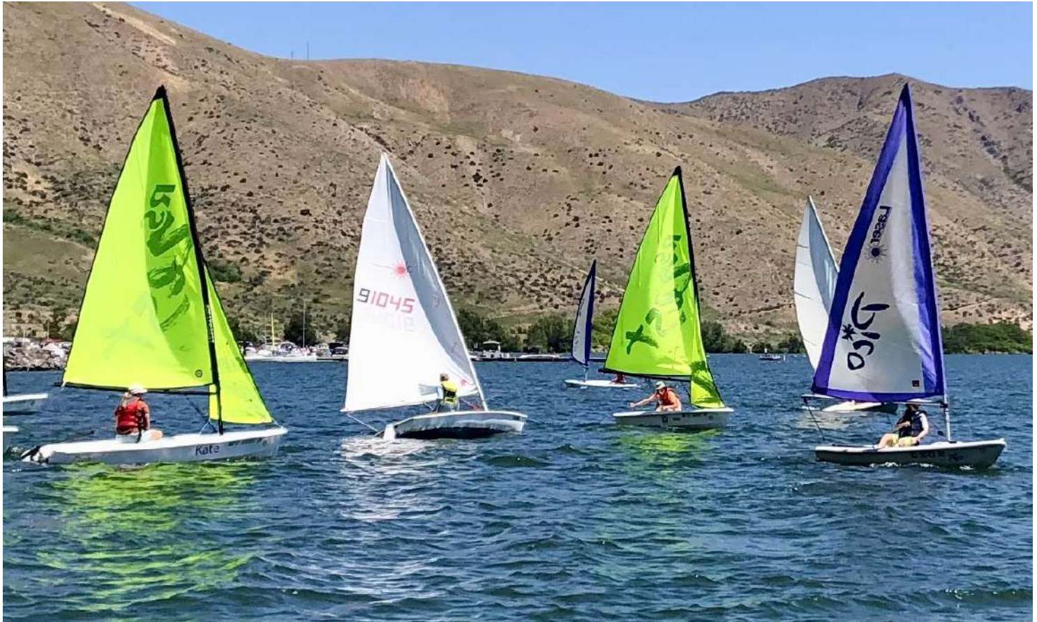
Pre-race start sailing. Looking out for fellow racers and determining their next move as start of the race approaches.