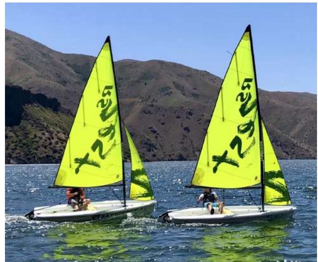
Fellow competitors in a tight race to the finish.