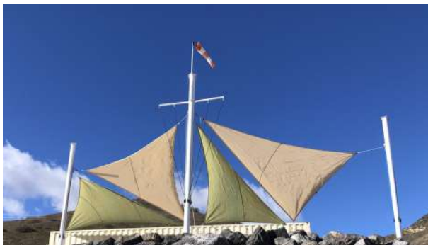
New Shade Sails - A Welcoming Sight.