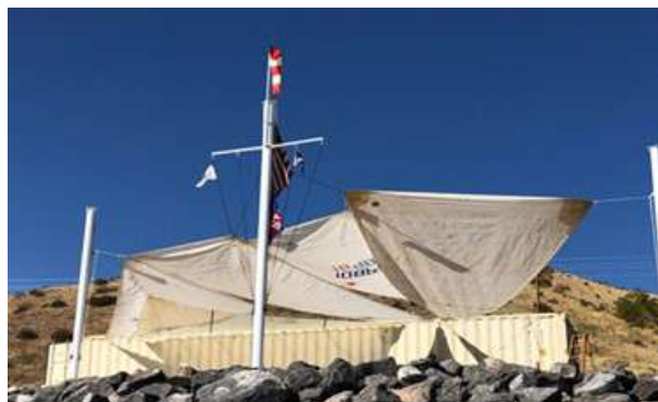
Previous Shade Sails - Progress.

The SISO Sailing Center provides the opportunity to learn in the great outdoors. The outdoor classroom enjoys the cool mornings which can be refreshing and may require youth sailors to wear a jacket to keep warm. However, hot afternoons require shade. Shade becomes a welcome relief from the direct sun.